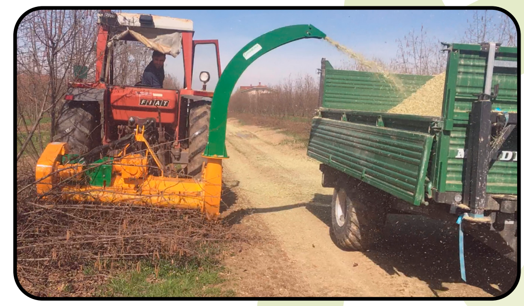
► Discharge chute