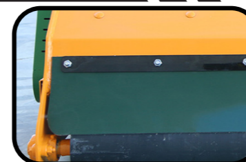
▶ Rear gums