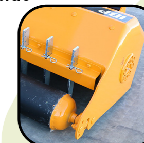
▶ Rounded side