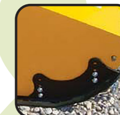
▶ Front adjustable skid shoes only for straight side