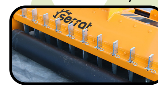
▶ Rear tine retainers