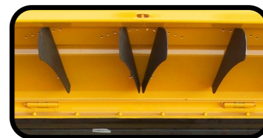
▶ Turn able nozzles