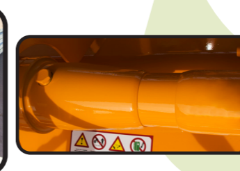
▶ Freewheel on sleeve