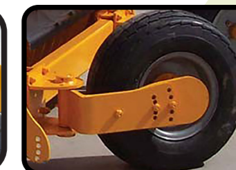
▶ Adjustable wheels