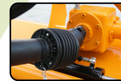
▶ Freewheel on transmission