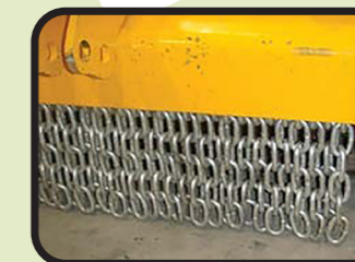
▶ Front wheels