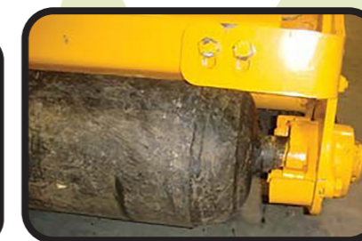
▶ Front chains