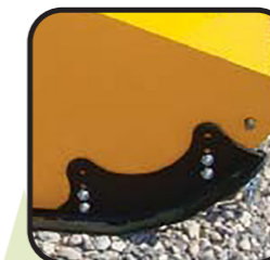
▶ Front skid shoes