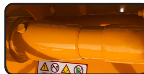
▶ Freewheel on sleeve