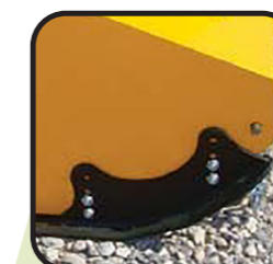
▶ Front skid shoes