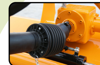
▶ Freewheel on transmission