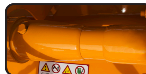
▶ Freewheel on sleeve