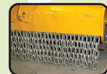
▶ Front wheels