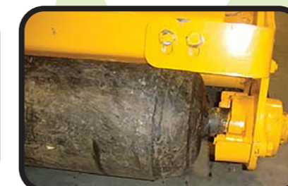
▶ Front chains