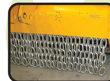
▶ Front chains