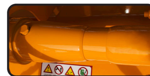
▶ Freewheel on sleeve