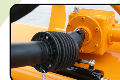
▶ Freewheel on transmission