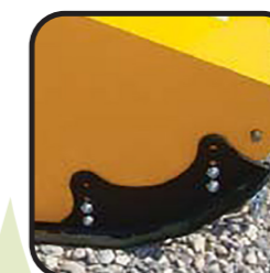
▶ Front skid shoes