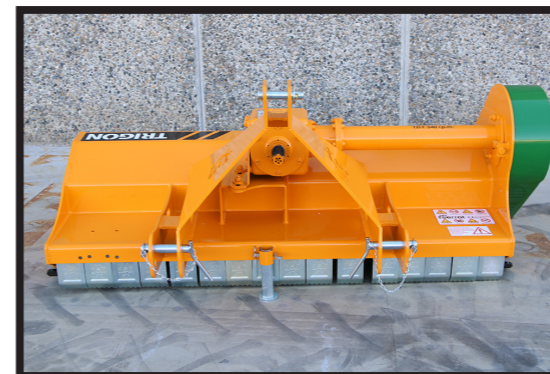
System antiwire in rotor