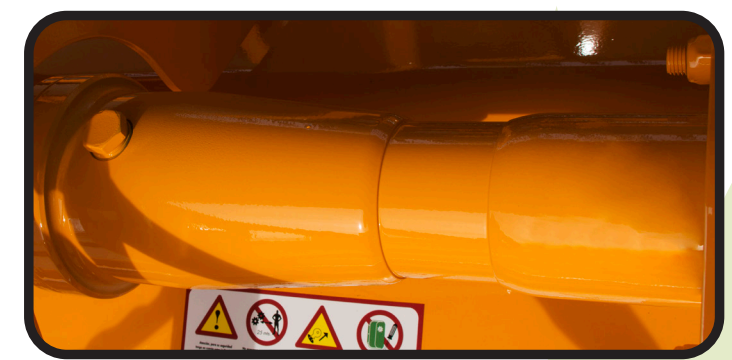
▶ Freewheel on sleeve