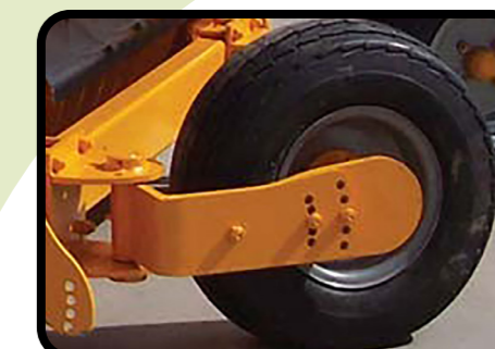
▶ Rear wheels