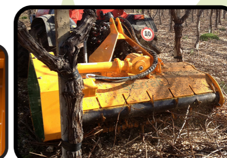
▶ Reverse or forward positions