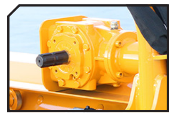
Gearbox with freewheel