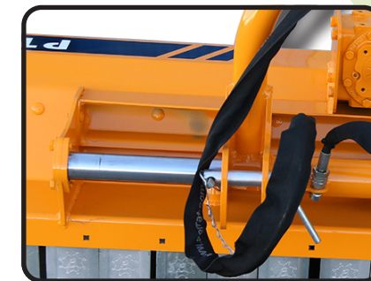
▶ Hydraulic side shift