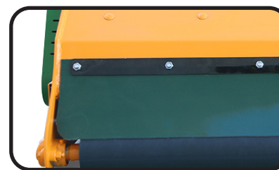
▶ Rear gum