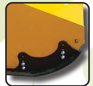
▶ Front adjustable skid shoes only for straight side