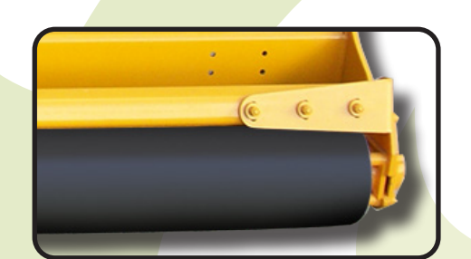
► Rear roller