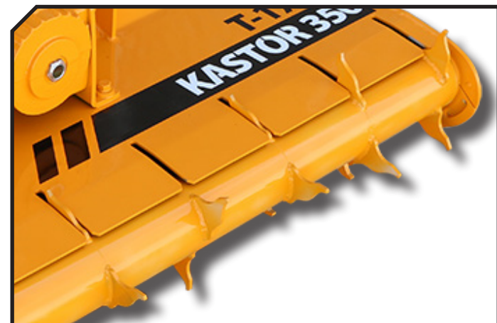
Triple feed chain