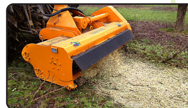
▶ Forward position