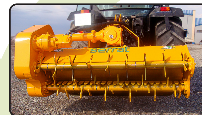
▶ Reverse position