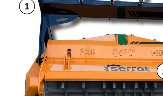
Blades DRR FIXE TOP System

Transmission by cardan to side belts RAIL BOX System (optional) with freewheel included System antiwire in rotor