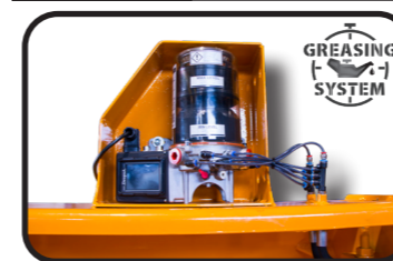
▶ Centralized greasing