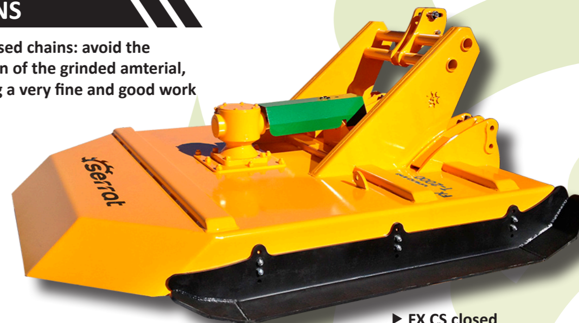
▶ FX CS closed