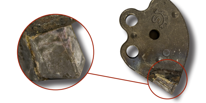
FIXE TOP System

1. Rear hydraulic hood 2. Hydraulic levelling roller