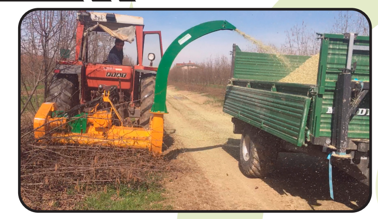
▶ Discharge chute