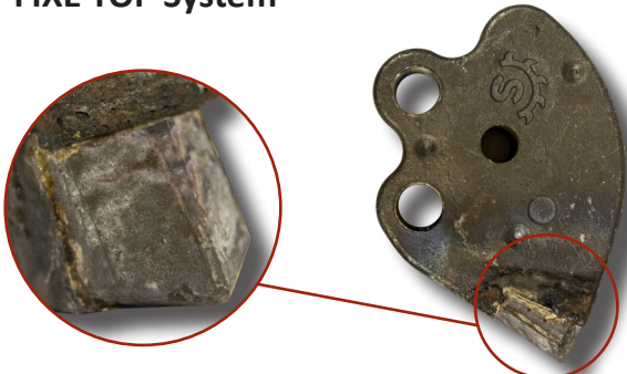
FIXE TOP System